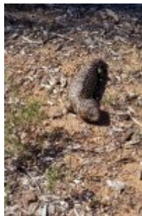
ABOVE: Shingleback Lizard