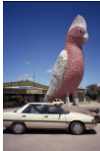
ABOVE: Big Galah at Kimba

The room I had at Wudinna was disappointing ($63.00). I think I prefer the cabins to motel rooms.