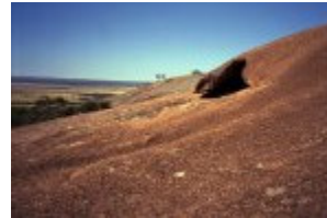
ABOVE: Mt Wudinna