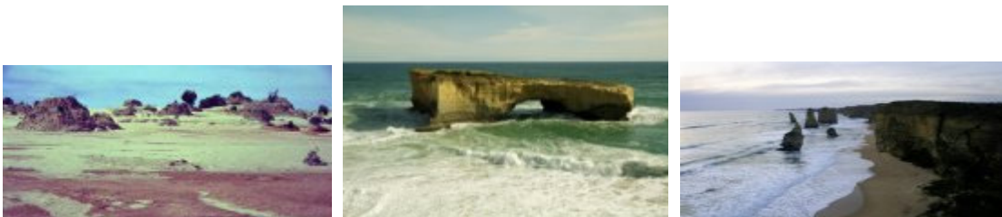
ABOVE: From left - Mungo National Park, London Bridge and the Twelve Apostles (Port Campbell National Park)

In October 2002 I went on my third Australia Trip. This journey took me fewer miles than the previous two but I still got to visit New South Wales, South Australia, Victoria and the Australian Capital Territory. It was a journey marred by several vehicle issues, though on this occasion I managed to avoid any major impacts with the wildlife.